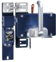
STS with TFA/TFI