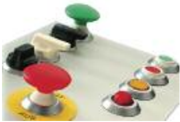
N-Series Control Devices & Indicator Lights