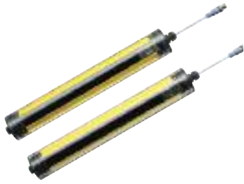
IP69K Light Curtain