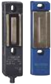
MZM120 (Pulse Echo)