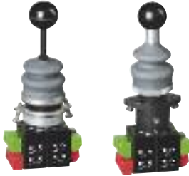
K Series joysticks