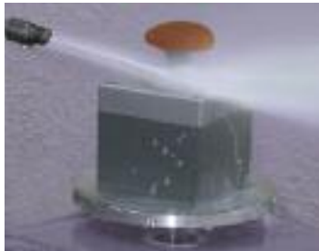
IP69K Test environment

Schmersal offers a range of products that meet IP69K sealing requirements ... tolerating high temperature (up to 80°C) steam or water washdowns at pressures up to 1500 psi. They are easy to clean, specifically designed to prevent the accumulation of process substances, dirt and/or bacteria.