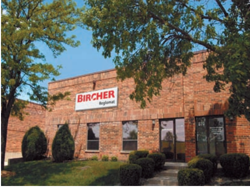
Bircher America, Inc facility Schaumburg, IL

Bircher America, Inc with its worldwide headquarters in Switzerland, is the motion and presence sensor specialist in the machine safeguarding, automatic pedestrian door, industrial door/gate and mass transit markets. Valuable long term and cooperative customer relationships, expertise and future-oriented innovations have been the key to our success over the last 50 years. Bircher America proudly manufactures safety mats and assembles sensing edges in the USA.