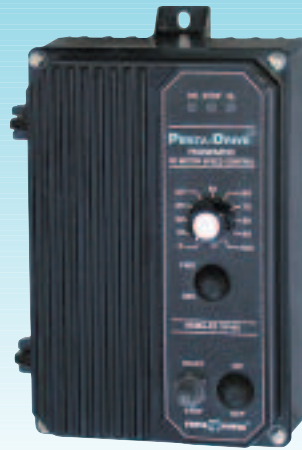
Model KBRC-240D KB Part No. 8840 (Black Case) KB Part No. 8841 (White Case)