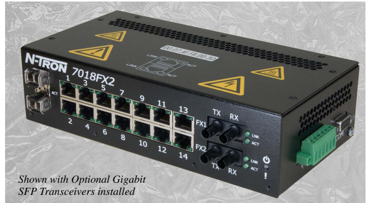
Shown with Optional Gigabit SFP Transceivers installed

DHCP -DHCP Server / Client automates the assignment of IP addresses. DHCP Option 82 assures that if a device on a specific port is replaced, the replacement receives the same IP address as the original device.