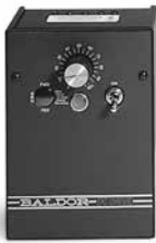
BC140 ENCLOSED (NEMA 1)

A Plug-in Horsepower Resistor® and armature fuse must be ordered and installed in BC138, BC139, BC140, BC140-FBR, BC141 and BC142.