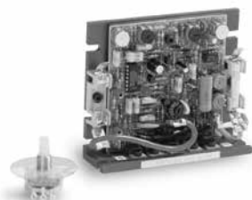
BC141 / BC142

115 VAC Single Phase 50/60 Hz. 230 VAC Single Phase 50/60 Hz.