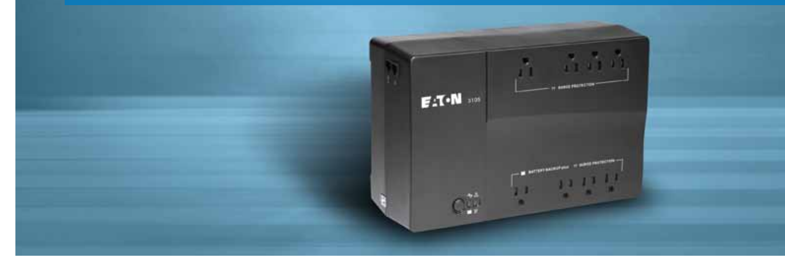
For detailed technical specs visit: www.eaton.com/3105