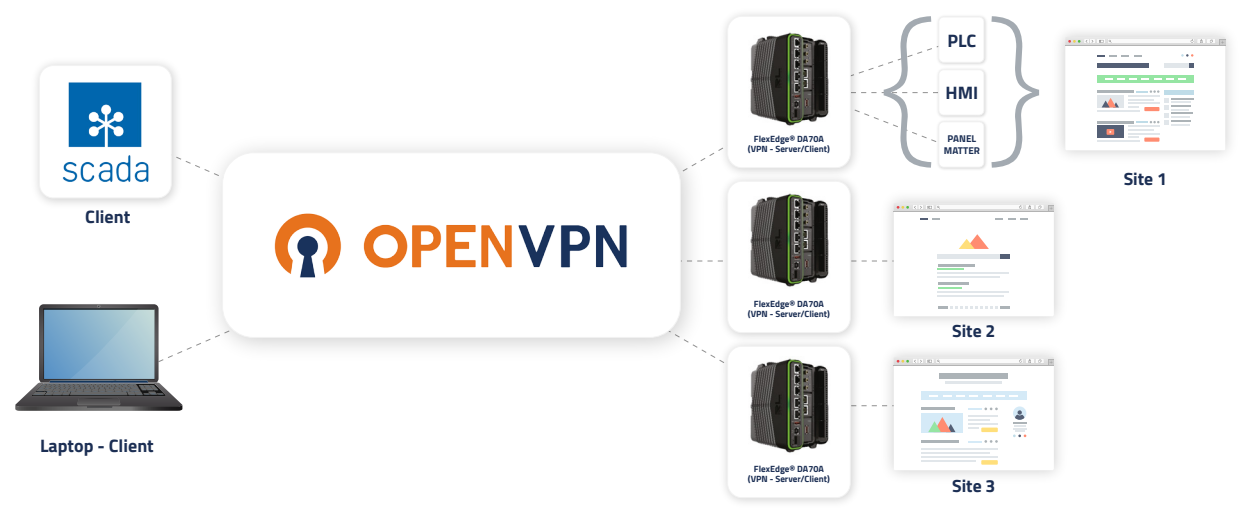
Figure 2: Open VPN Installation with FlexEdge®

The FlexEdge® Advanced IIoT edge controller powered by Crimson® software provides a reliable solution that addresses both plant floor and remote location network connectivity requirements. This OpenVPN solution can be used in a wide variety of applications and scenarios without the need for additional tools.