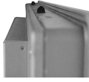
Screw to set up the snap hook out of upper side