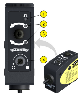
Figure 1. Features

The fast 10 kHz switching frequency and 15 microsecond repeatability ensure reliability in high-speed operations. Models are available with a parallel or perpendicular sensing image, as well as a 20 millisecond OFF-delay to solve a variety of applications. The rugged zinc alloy die-cast housing and high quality acrylic lens are designed to handle ambient electrical noise and vibration from presses and die cutting machinery.