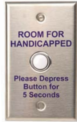
NOTE: Shown with 620 push button, not included.