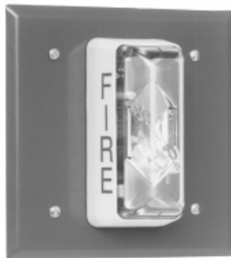
Cat. No. 2441S