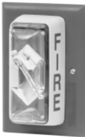
Cat. No. 2440S