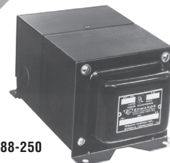
Cat. No. 88-250

Edwards 88 Series Transformers provide low voltage source from 50 to 250 volt amps for all large signaling installations.