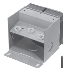
Cat. No. 88-50