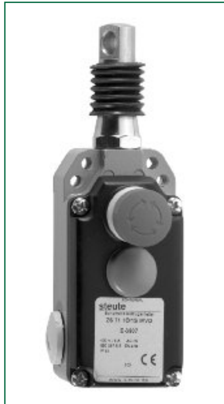
ZS71-10/1S WVD-NA Emergency pushbutton option

For recommended installation instructions, please see page 117.