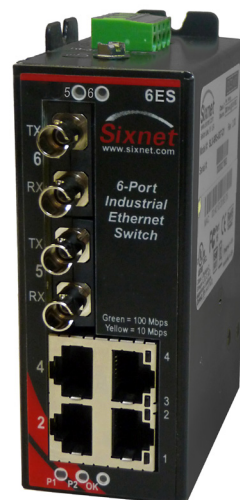
SLX-6ES-4/5 Aluminum Case Wide Temperature

We have been designing industrial hardware such as Remote Terminal Units for over 30+ years and have used this expertise to design the toughest Ethernet switches on the market. Don't trust your critical communications to so-called industrial hardware from commercial switch manufacturers. Sixnet switches give you proven assurance that your system will keep running for years to come.