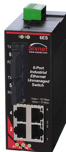
SL-6ES-4/5 Lexan Case Standard Temperature