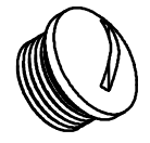
CLOSURE CAPS (2 INCLUDED)