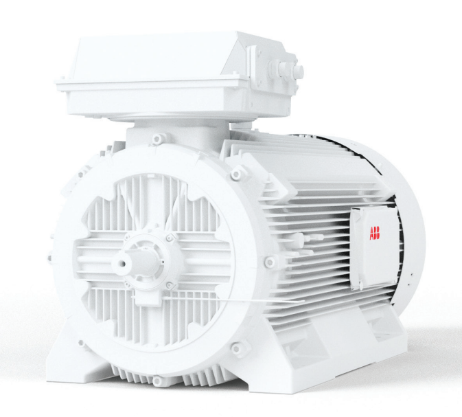
ABB Ability™ Smart Sensor is a condition monitoring solution that makes predictive maintenance possible for almost all low voltage motors. By monitoring and analyzing data on motor operating parameters, it enables motor users to optimize their maintenance. The solution helps to reduce downtime by as much as 70 percent, extend motor lifetimes by up to 30 percent and reduce energy consumption by up to 10%.